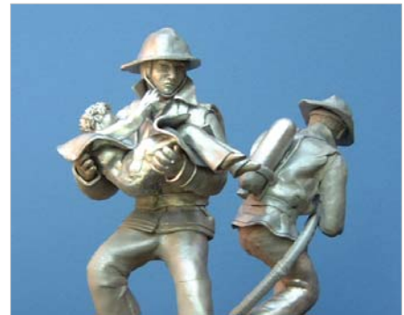
Small scale model of Fire Fighter statues.

hearts and pilgrimages are often made to visit them. I wanted to help create a similar space for our Nation's Capital.