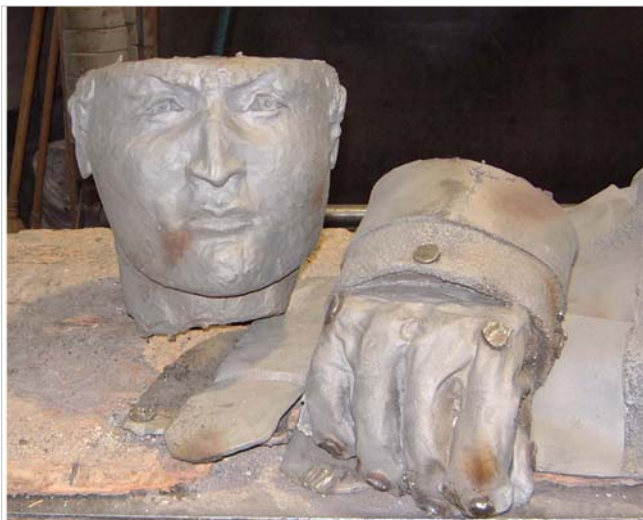
Cast Stainless Steel pieces of statues before assembly.

The inspiration behind the statues I designed as central elements of the Ottawa Fire Fighters Memorial came from a comment made by a friend, who is a fire fighter himself. He made a comparison between fighting fires and going into battle, explaining the bond that exists within the brotherhood of fire fighters.